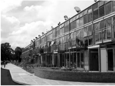
Figure C.22 Orientation and design to take advantage of passive solar gain.