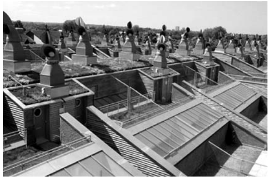
Figure C.23 Using the roofs to give private gardens in a high-density development.