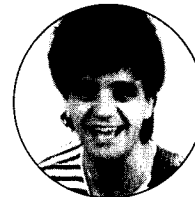
Virtuoso Frank Gambale is a member of Chick Corea's Electric Band, and a respected solo artist, teacher, and author.

We'll continue our melodic minor explorations next time. Until then, improvise to your heart's content. Bon voyage!