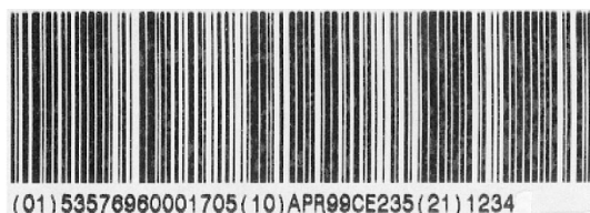
Figure 2. An EAN128 code

or by automatic capture through optical or radio frequency techniques.