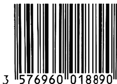
Figure 1. An EAN13 code